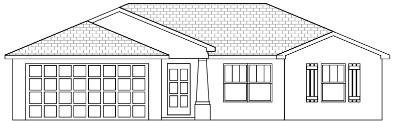
Standard Elevation "A"