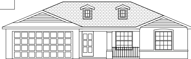
Optional Elevation "B"