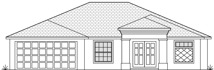
Standard Elevation "A"