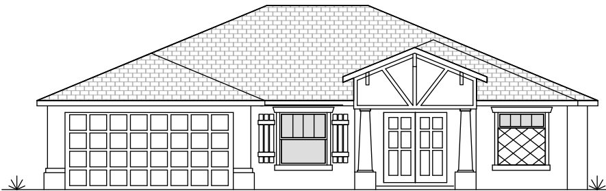
Optional Elevation "B"