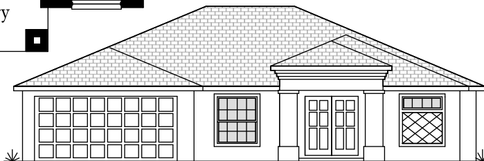
Standard Elevation "A"