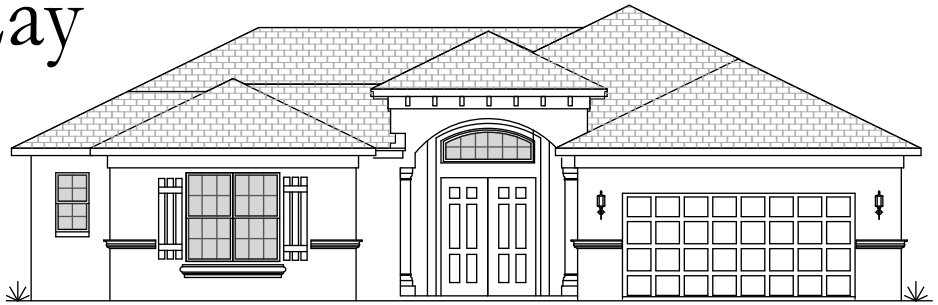
Standard Elevation "A"