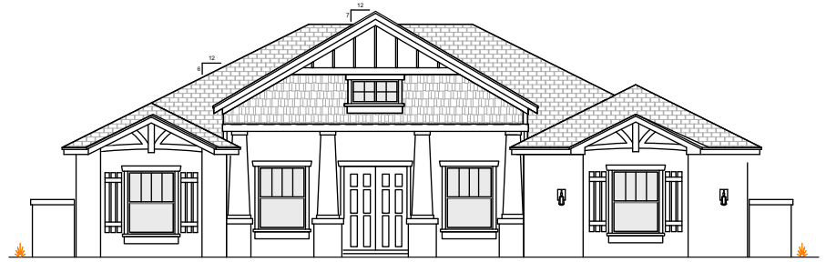
Elevation "B" (Optional)