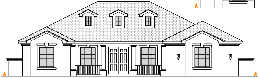
Standard Elevation "A"